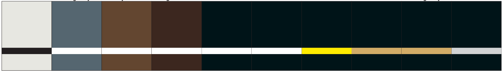
LM922-324 Light Grey/Black LM922-312 Smoke Grey/White LM922-822 Med. Brown/White LM922-842 Dark Brown/White LM9X2-402 Black/White LM922-422 Gloss Black/White LM922-407 Black/Yellow LM922-417 Black/Gold LM922-427 Gloss Black/Gold LM922-413 Black/Silver