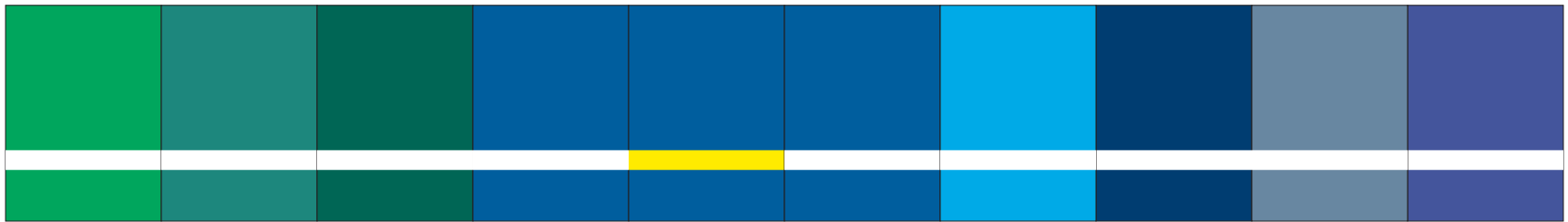
LM922-932 Kelley Green/White LM922-972 Celadon Green/White LM922-912 Evergreen/White LM9X2-512 Sky Blue/White LM922-517 Sky Blue/Yellow LM9X2-502 Sapphire/White LM922-562 Light Blue/White LM922-552 Patriot Blue/White LM922-382 China Blue/White LM922-582 Purple/White