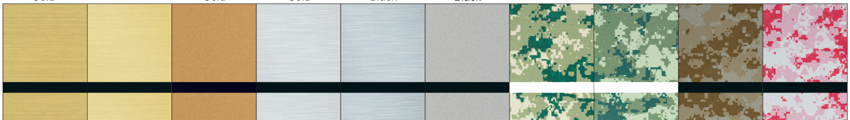
LM9X2-734* Br. Gold/Black LM9X2-754*♦ European Gold/Black LM922-714* Smooth Gold/Black LM9X2-354* Br. Alum./Black LM922-334* Br. Silver/Black LM922-344* Smooth Silver/Black LM922-922 Digicam Std. Issue/White LM922-982 Digicam Green/White LM922-844 Digicam Desert Storm/Black LM922-694 Digicam Pink/Black

*Some LaserMax® foils are not recommended for applications in which UV stability is a requirement.