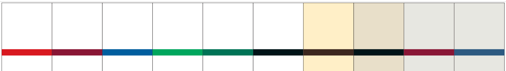
LM922-206 White/Crimson LM922-226 White/Burgundy LM922-205 White/Sky Blue LM922-209 White/Bright Green LM922-269 White/Pine Green LM9X2-204 White/Black LM922-228 Ivory/Dark Brown LM922-854 Almond/Black LM922-326 Light Grey/Burgundy LM922-325 Light Grey/Marine Blue