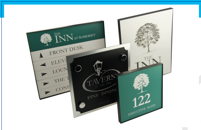
LaserMax® Sign Kit item #9034

You may place your LaserMax® Sign Kit order at www.rowmark.com , or fabricate the signs on your own using the file found under the downloads section of our website.