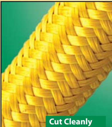
Cut Cleanly Kevlar Shears