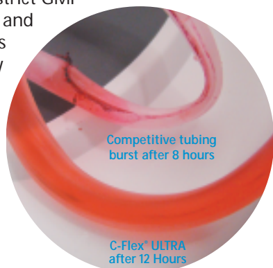
In a 24-hour pumping trial, competitive tubing failed at less than 12 hours.