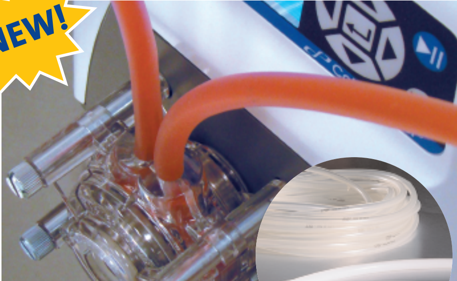
C-Flex ® ULTRA shown being pumped using a Cole-Parmer MasterFlex L/S ® Standard pump head.