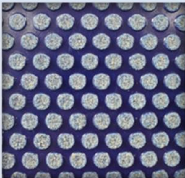
Braxx ® - Sand

Ultra High Molecular Weight Polyethylene - Braxx ®