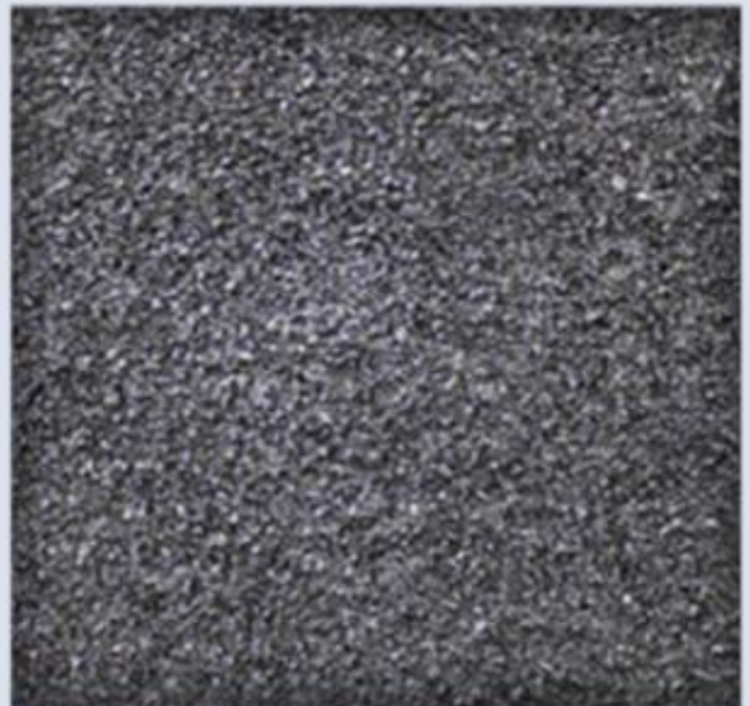
Luns® - Slag

Stair Treads Marina Gangways Wheel Chair Ramps Pedestrian Walkways Vehicular Anti-Slipping Forklift Inclines and Dock Plates