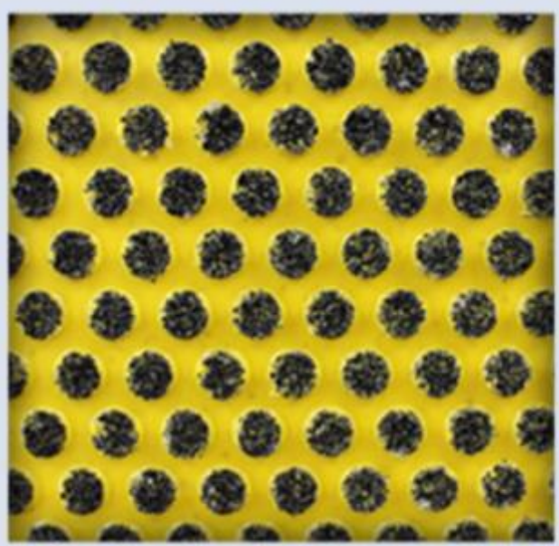
Braxx ® - Slag