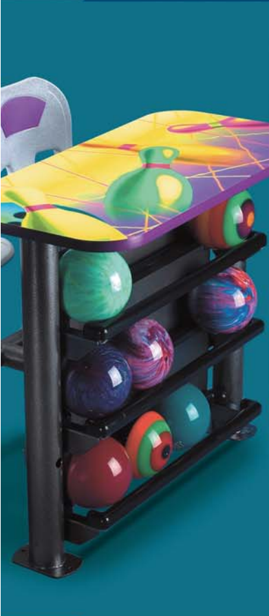
Furniture and Commercial Fixtures