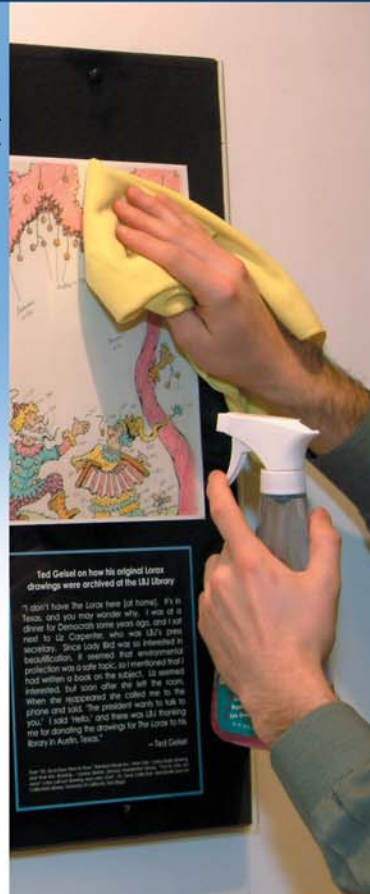
Framing and Enduring Presentation of Artwork