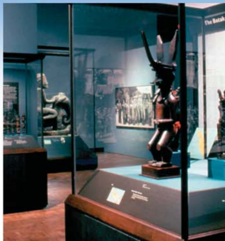
Museum Vitrines and Display Cases