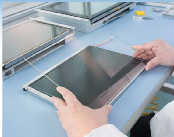
Integral Protection for LCD Device Panels