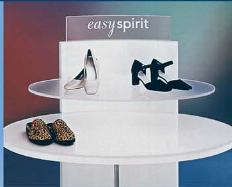
Retail Fixtures and Store Displays