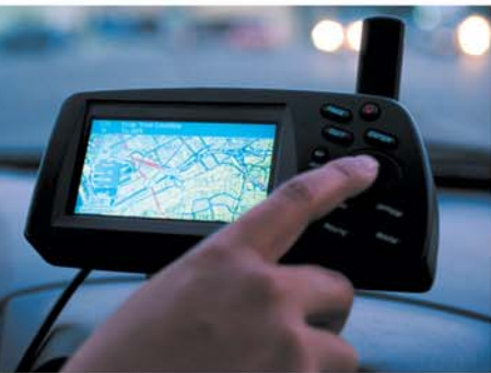
Consumer Electronics / Displays