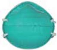
Small Size PT-N95CS-06 TC-84A-9280