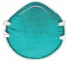
Regular Size PT-N95C-06 TC-84A-9281