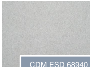
CDM ESD 68940