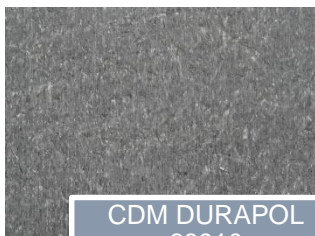
CDM DURAPOL 68910